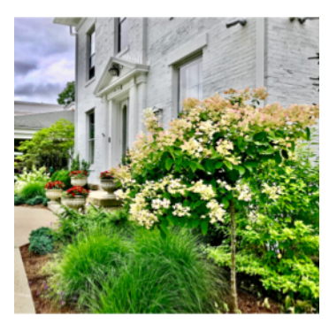
10 - South/Cannon Green

281 Main Street South, gardens surround the Shove building.