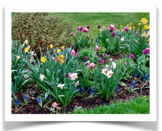
The Pomperaug Valley Garden Club

invites you to tour the public gardens of Woodbury, which are designed and maintained by its members.